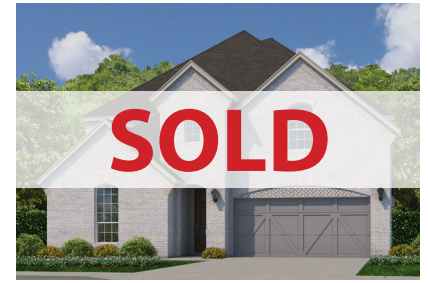
4709 IMPRESSION LANE Plan 1146A | 4,098 s.f. | 2-Story 5 Beds | 4.5 Baths | Study | Game Room Media Room | 2 Dining Areas | 2-Car Garage MLS#20618196