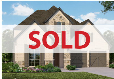
4818 IMPRESSION LANE Plan 1118G | 3,643 s.f. | 2-Story 4 Beds | 4 Baths | Study | Game Room Media Room | 2 Dining Areas | 2-Car Garage