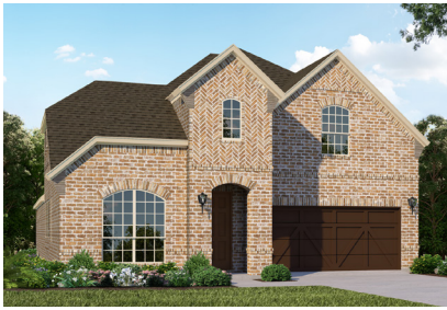
3808 COMPOSITION $860,895 | Available December Plan 1155A | 3,447 s.f. | 2-Story 5 Beds | 4 Baths | Study | Game Room Media Room | 2-Car Garage