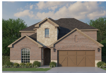
3347 WINECUP ROAD $711,760 | Available November Plan 1527A w/stone | 3,187 s.f. | 2-Story 4 Beds | 3 Baths | Study | Game Room Media Room | 2.5-Car Garage N.W. Facing