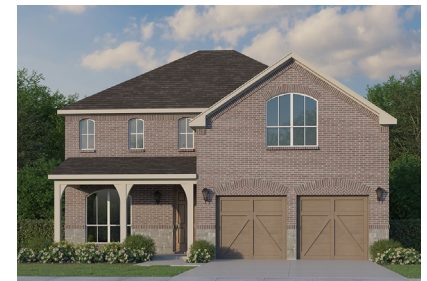
3116 MAIDENHAIR LANE $735,490 | Available November Plan 1542A w/stone | 3,178 s.f. | 2-Story 4 Beds | 4 Baths | Study | Game Room Media Room - Down | 2-Car Garage S.E. Facing