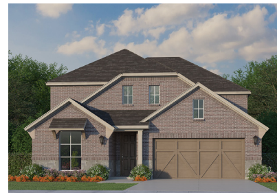
112 TORNILLO DRIVE $770,900 | Available December Plan 1534A w/stone | 3,506 s.f. | 2-Story 4 Beds | 4 Baths | Study | Game Room Media Room | 3-Car Tandem Garage N. Facing