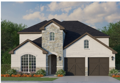
3112 MAIDENHAIR LANE $736,875 | Available November Plan 1534A w/stone | 3,506 s.f. | 2-Story 4 Beds | 4 Baths | Study | Game Room Media Room | 3-Car Tandem Garage S.E. Facing