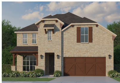
3105 AUTUMN SAGE $711,150 | Available December Plan 1542B | 3,178 s.f. | 2-Story 4 Beds | 4 Baths | Study | Game Room Media Room - Down | 2-Car Garage W. Facing