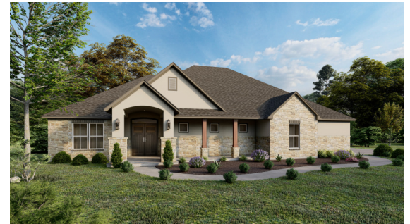
See website for additional imagery.