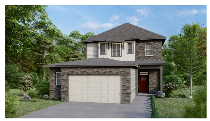
Elevation A with 5' Garage Extension