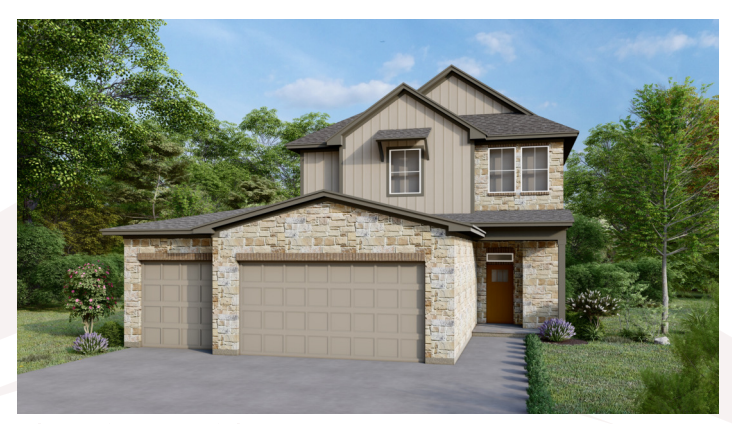
Elevation C with 3 Car Garage