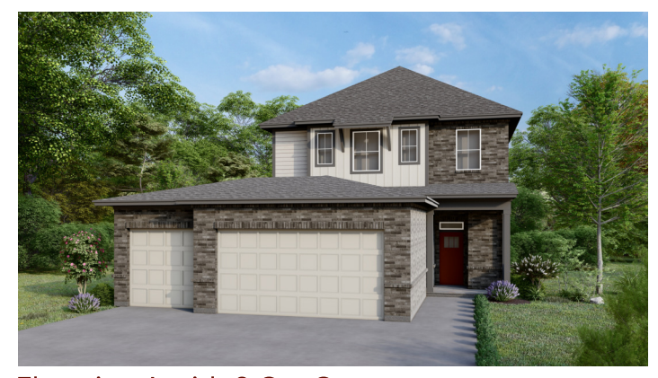
Elevation A with 3 Car Garage