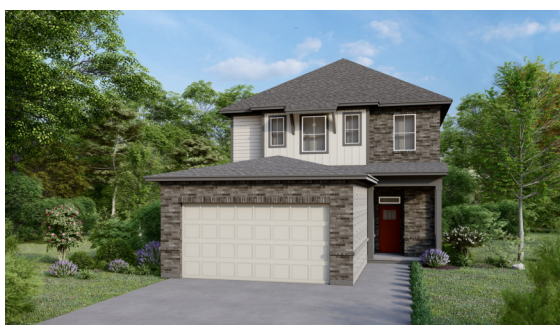
See next page or website for additional imagery