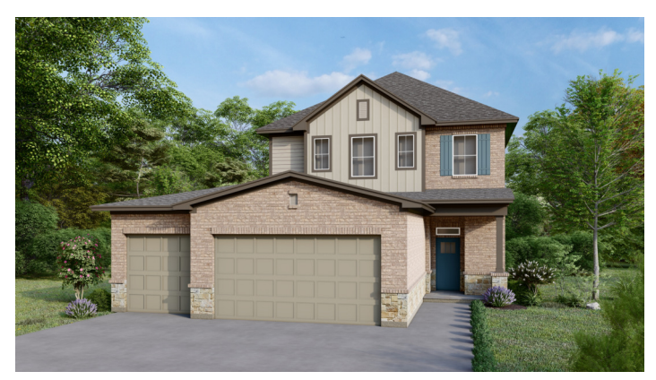
Elevation B with 3 Car Garage