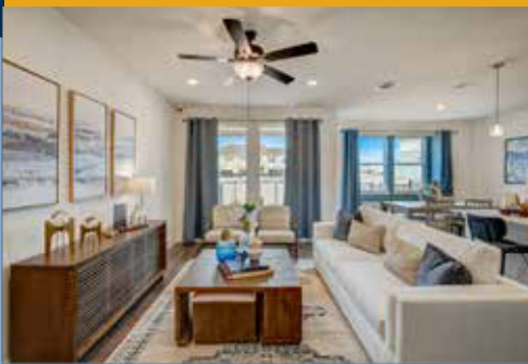
18909 Schultz #1102 $371,560

Robson Floor Plan | 4-Plex 3 bed | 2.5 bath | 2 story