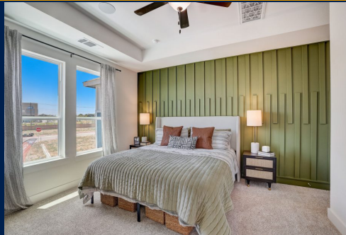
18909 Schultz #1004