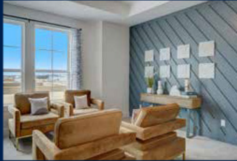
18909 Schultz #1101 $362,770

Sanford Floor Plan | 4-Plex 3 bed | 2.5 bath | 2 story