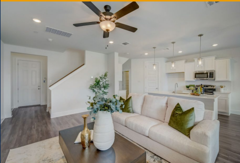
18909 Schultz #1003