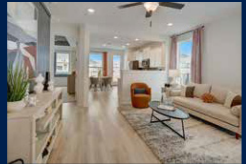
18909 Schultz #1203 $362,770

Sanford Floor Plan | 3-Plex 3 bed | 2.5 bath | 2 story