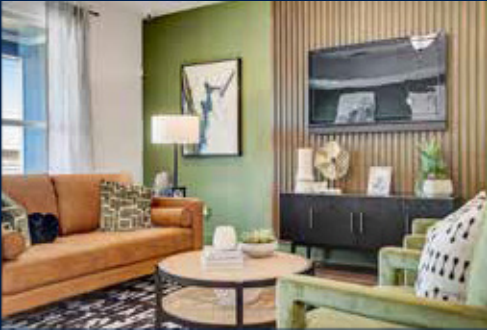
18909 Schultz #1103 $348,560

Odin Floor Plan | 4-Plex 3 bed | 2.5 bath | 2 story