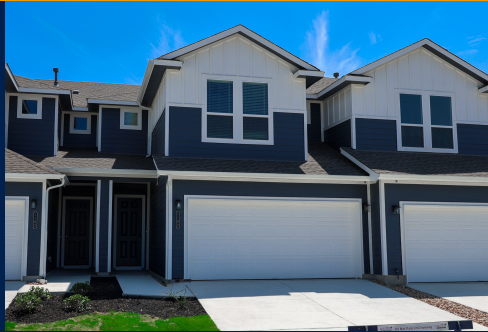
18909 Schultz #1102 $361,560

Sanford Floor Plan 3 bed | 2.5 bath | 2 story