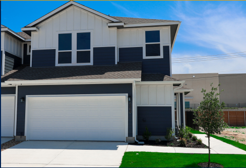
18909 Schultz #1101 SOLD!

Sanford Floor Plan 3 bed | 2.5 bath | 2 story