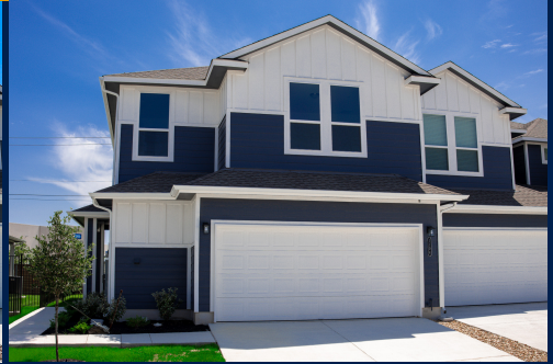
18909 Schultz #1104 $388,245

Robson Floor Plan 3 bed | 2.5 bath | 2 story