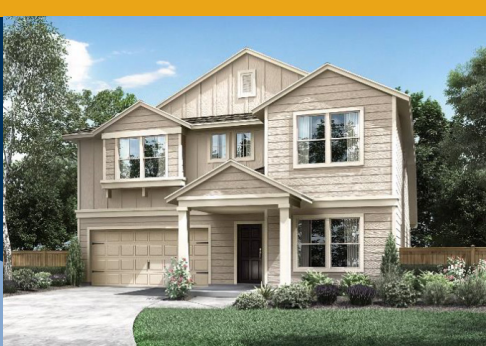
153 Wagon Spoke Way $495,900

Chandler Floor Plan 3 bed | 2 bath | 1 story