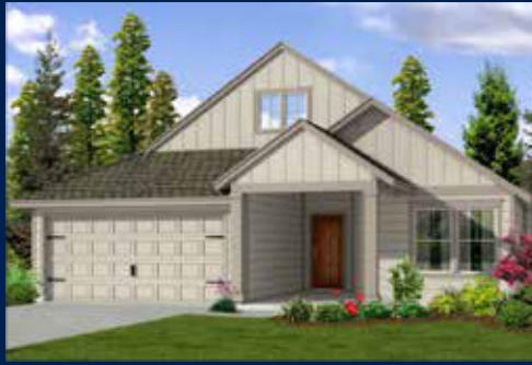
101 Wild Sage Lane $423,900

Dormer Floor Plan 4 bed | 2.5 bath | 2 story