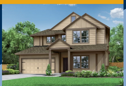
169 Wagon Spoke Way $488,990

Driftwood Floor Plan 4 bed | 2.5 bath | 2 story