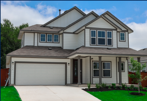
113 Wagon Spoke Way SOLD!

Dormer Floor Plan 4 bed | 2.5 bath | 2 story