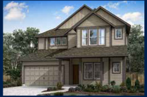
105 Wild Sage Lane $489,900

Chandler Floor Plan 3 bed | 2 bath | 1 story