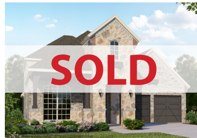
3804 WILD TULIP Plan 1118J | 3,643 s.f. | 2-Story 4 Beds | 4 Baths | Study | Game Room Media Room | 2-Car Garage