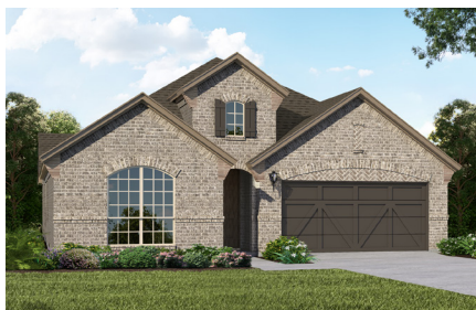
4417 MINNOW COVE RD $545,020 | Available August Plan 1523A | 2,268 s.f. | 1-Story 3 Beds | 2.5 Baths | Study 3-Car Garage