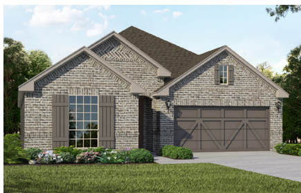
9300 SUNSET LN $537,915 | Available NOW! Plan 1521B | 2,168 s.f. | 1-Story 3 Beds | 2.5 Baths | Study 2-Car Garage