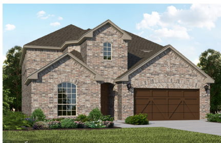
9321 ROYAL FOREST DR $655,090 | Available NOW! Plan 1527A | 3,160 s.f. | MLS#20564973 2-Story | 4 Beds | 3 Baths | Study Media Room | 2-Car Garage