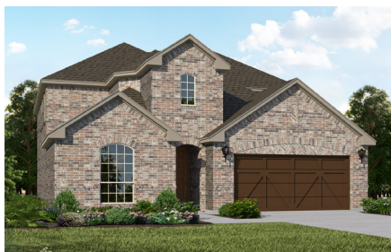
4505 MINNOW COVE RD $652,130 | Available July Plan 1527B | 3,160 s.f. | 2-Story 4 Beds | 3 Baths | Study Media Room | 2-Car Garage