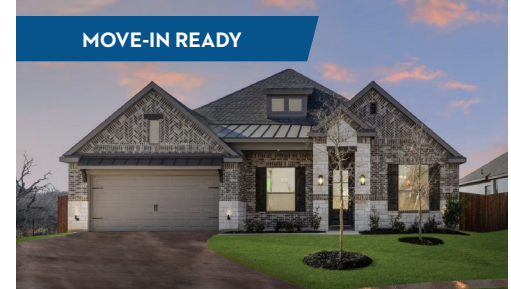
101 Mockingbird Hill Drive $475,079 2,533 SQFT 3 Bedrooms + Study 2 Baths 1 Story