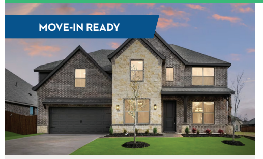
148 Mockingbird Hill Drive $442,888 <del>$523,568</del> 3,148 SQFT 4 Bedrooms + Game Room 3.5 Baths