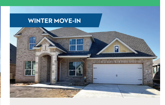
35 Harrier Street $536,264 3,202 SQFT 5 Bedrooms + Media Room 3.5 Baths