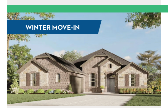
34 Harrier Street $446,986 2,370 SQFT 4 Bedrooms 2 Baths 2-Car Garage