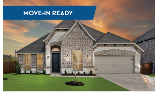
152 Mockingbird Hill Drive $412,888 <del>$483,770</del> 2,642 SQFT 4 Bedrooms + Study 2.5 Baths 1 Story