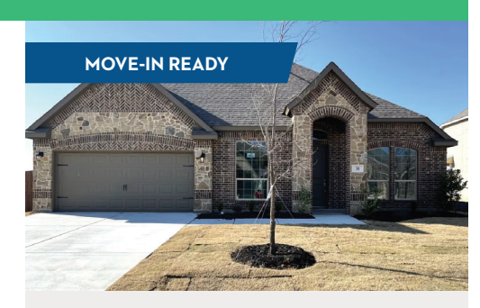
31 Harrier Street $475,517 2,622 SQFT 4 Bedrooms + Study 2.5 Baths 1 Story