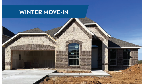
39 Harrier Street $485,598 2,689 SQFT 4 Bedrooms + LiveGen Suite 3.5 Baths