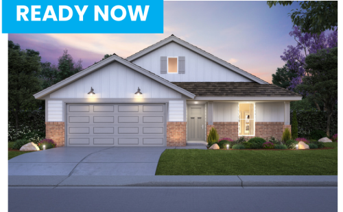
44 Road 5102A – Cypress Plan 1,649 sqft, 4 Bed, 2 Bath