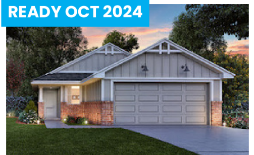
146 Road 51030 - Cypress Plan 1,378 sqft, 3 Bed, 2 Bath