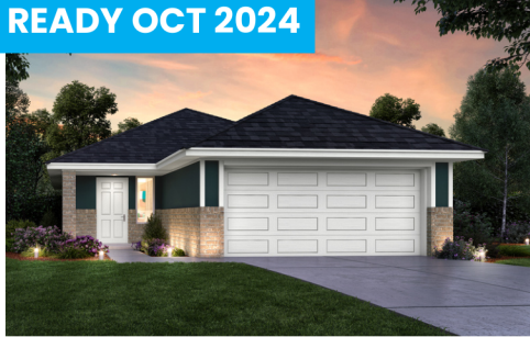
867 Road 51030 - Bluebonnet Plan 1,308 sqft, 3 Bed, 2 Bath