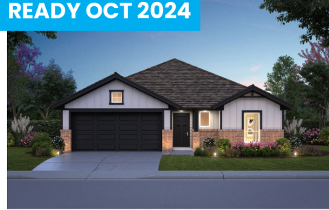
105 Road 51030 - Bradford Plan 1,416 sqft, 4 Bed, 3 Bath