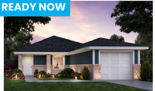
1225 Road 5202 – Daisy Plan 1,249sqft, 3 Bed, 2 Bath