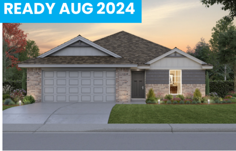
135 Road 5102B - Cypress Plan 1,649 sqft, 4 Bed, 2 Bath