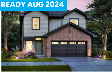
165 Road 51030 - Holly Plan 1,868 sqft, 4 Bed, 2.5 Bath