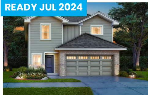
111 Road 5102B– Holly Plan 1,868 sqft, 4 Bed, 2.5 Bath