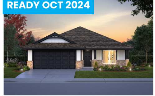
104 Road 5102A - Redwood Plan 1,686 sqft, 4 Bed, 2 Bath