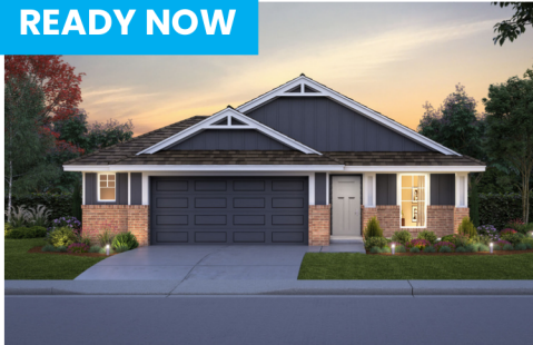
96 Road 51030 – Spruce Plan 1,518 sqft, 4 Bed, 2 Bath