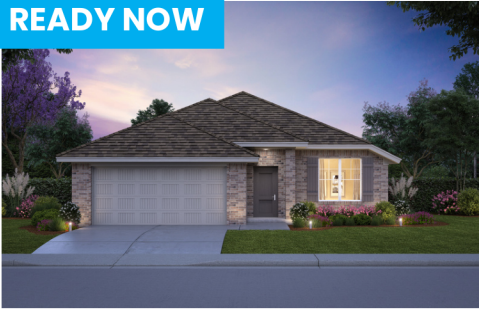
903 Road 5102A – Redwood Plan 1,686 sqft, 4 Bed, 2 Bath