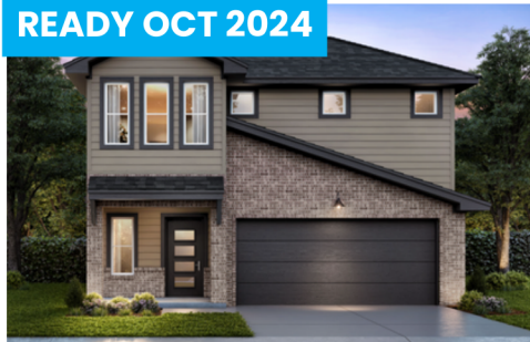
125 Road 51030 - Lantana Plan 1,308 sqft, 3 Bed, 2 Bath