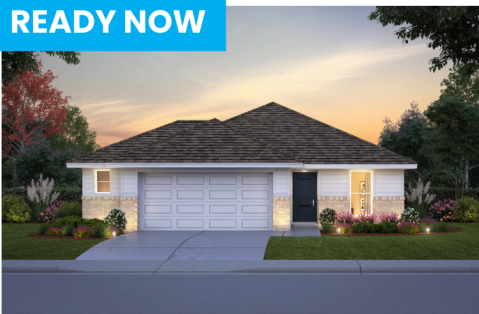
84 Road 5102A – Spruce Plan 1,518 sqft, 4 Bed, 2 Bath